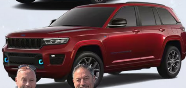
2023 JEEP GRAND CHEROKEE 4XE