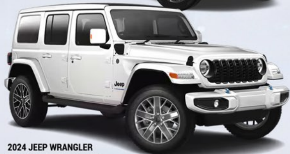
2024 JEEP WRANGLER 4-DOOR HIGH ALTITUDE 4XE