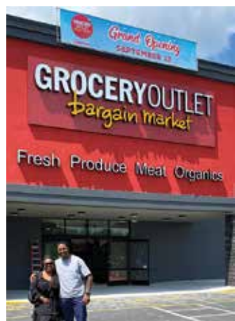
Grand Opening September 12, 10:00am

We were all sad to see the ShopRite leave and we all have been patiently waiting for Grocery Outlet to open. Now we know that Grocery Outlet is slated to open on September 12, 2024. I am so excited to support Grocery Outlet and I am sure we will show the store owners how dedicated we will be to their store.