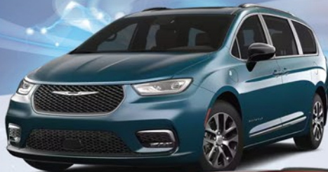
2023 CHRYSLER PACIFICA PLUG-IN HYBRID PINNACLE