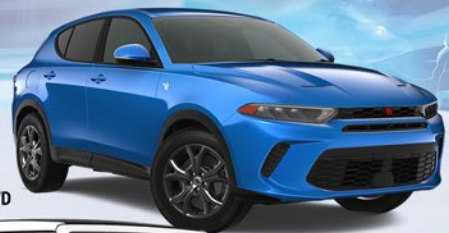
2024 DODGE HORNET R/T EAWD